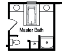
First Floor Plan Layout 9 foot Ceilings Optional Master Bath